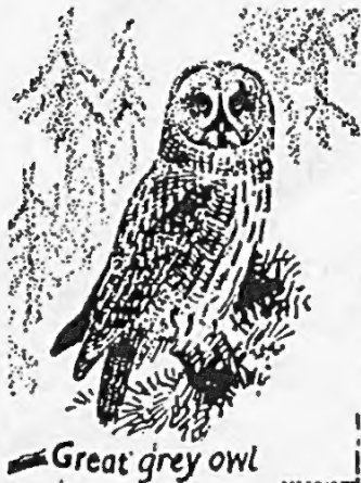
Great grey owl

Birds of Prey were shown, such as the Bald Eagle, Cooper's Hawk, American Kestrel, and Merlin. Turkey Vultures are numerous and use the thermals to gain height and soar, looking for carrion. Ruffed Grouse and Wild Turkey also featured. Sandhill Cranes and Whooping Cranes caused some discussion, then the extinction of the Passenger Pigeon was mentioned—the reasons being overhunting combined with slow breeding.